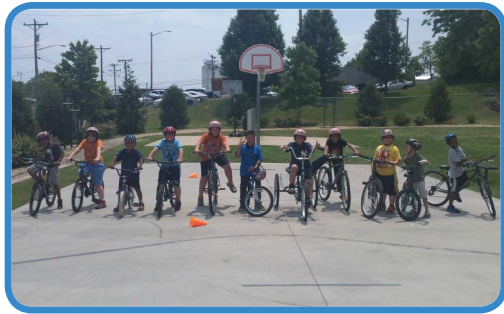
Bicycle Safety Program at Minnick Education Center, Harrisonburg

Check out the QuickStart Mini-grants webpage to see a list of eligible items and learn more about the activities funded to date.