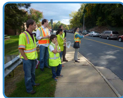
Participants during a Walkabout at Walker Upper Elementary School, Charlottesville