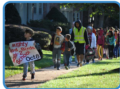
Walk to School Day at Cardinal Forest Elementary School, West Springfield

QuickStart Mini-grants are $1,000 grants for schools that are interested in funding a small (or large) Safe Routes to School activity. These grants are easy to apply for and are a great way to start up a SRTS program!