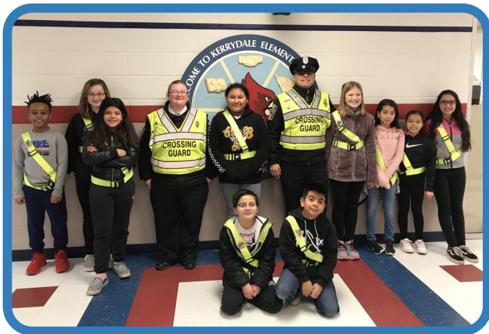
In Woodbridge, Kerrydale Elementary's two crossing guards serve as role models for the 2020 student safety patrol and the rest of the Kerrydale community.