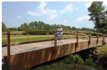
First Landing State Park

On Tuesday, September 12, we are offering five mobile workshops which highlight projects in the Hampton Roads - Virginia Beach area. For information on these mobile workshops, check our website .