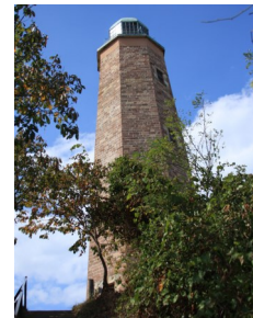
Cape Henry Lighthouse